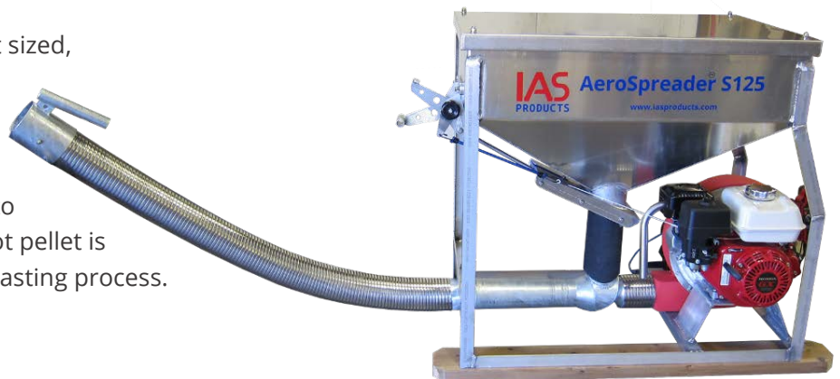
AeroSpreader™ S125 base model