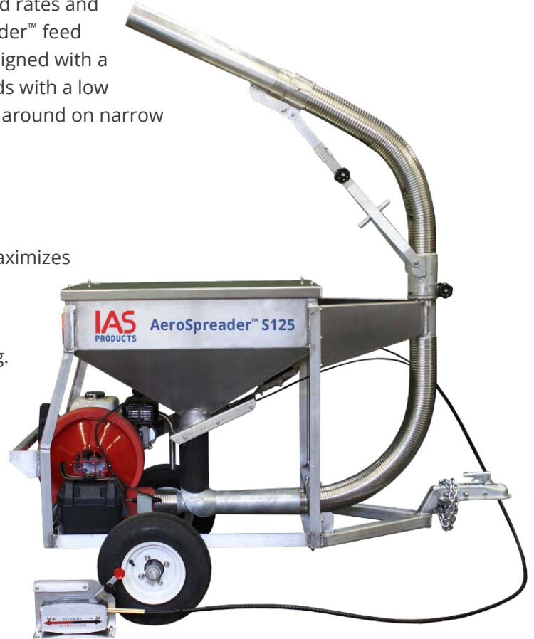
AeroSpreader™ S125 trailer model with Manual Periscope Feed Head™, Feed Extension Tube, and Extended Cable Controls

Internal feeder surfaces and edges designed to ensure no feed pellet remains trapped and not pellet is damaged or broken during feed pellet broadcasting process.