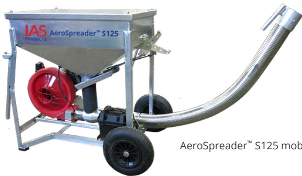
AeroSpreader™ S125 mobile model

Feed hopper size can be customized. Specifications and design subject to change without notice. Designed and manufactured in Canada.