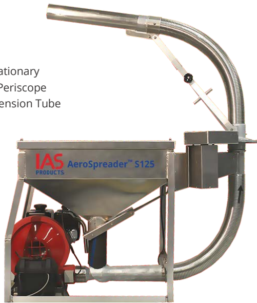
AeroSpreader™ S125 stationary model with Automatic Periscope Feed Head™ & Feed Extension Tube