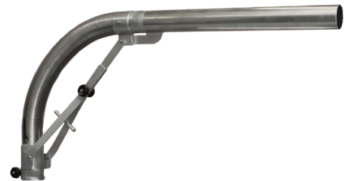
Manual Periscope Feed Head™ with Feed Extension Tube to maximize feed broadcast distance and control